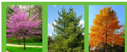
Eastern Redbud Eastern White Pine Tulip Poplar

Get a Tree Planted in Your Yard for Only $5!